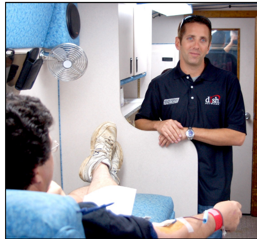
Greg Biffle speaks with Red Cross blood donors. Biffle, driver of the No. 16 Roush Ford, is a member of the American Red Cross National Celebrity Cabinet.

"We hope NASCAR fans will follow Greg Biffle's lead and sup-