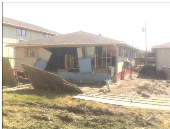
Hurricane Ike's strong winds, plus several feet of water caused major damage to this home in Sabine Pass, Texas.

The county did provide a shower trailer and parked it across the street from the church. A community agency provided a washer and dryer for the Oak Island residents to wash clothes. The health department backed off the quarantine threat.